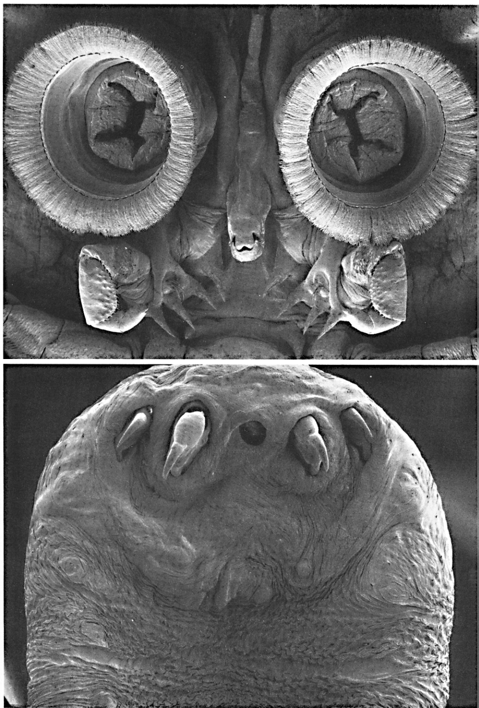
FIG. 1.—Anterior, ventral surface of Argulus nobilis (top) and anterior portion of Porocephalus crotali (bottom). Both photomicrographs are by SEM.